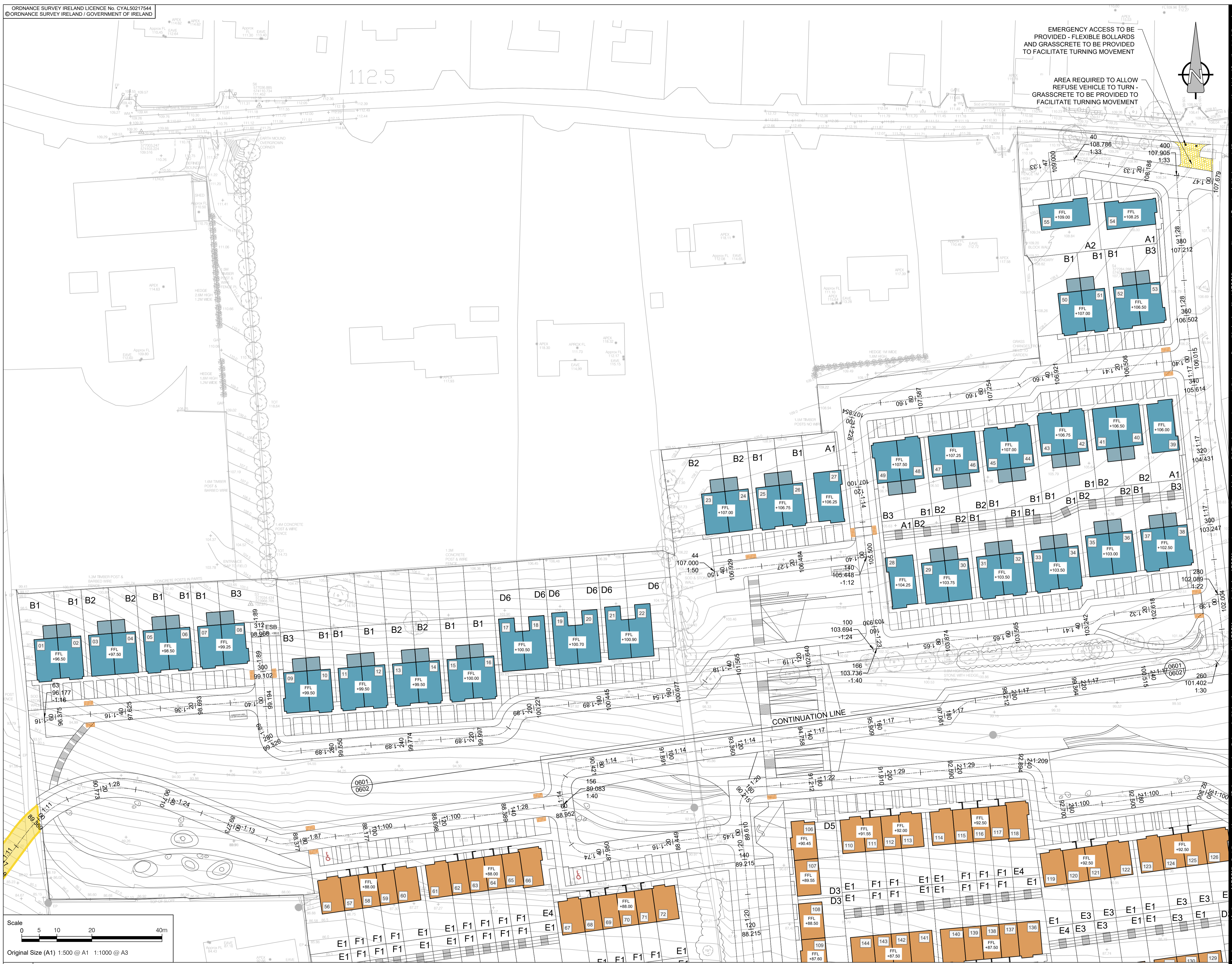
A PROPOSED SITE LEVELS

Last saved by: AILEEN PRENDERGAST (2021-10-26) Last Plotted: 2021-12-03 Filename: \\EU.AECOM\NET\COM\BIBL\JOBS\IPR-333515_GLOUNTHAUNE_PHASE_2\900_CAD_GIS\904_CEO1_WIP\02_SHEETS\0592432-ACM-00-00-DR-CE-10-0601.DWG Project Management Initials: Designer: MC Checked: AP Approved: EMcK ISO A1 594mm x 841mm